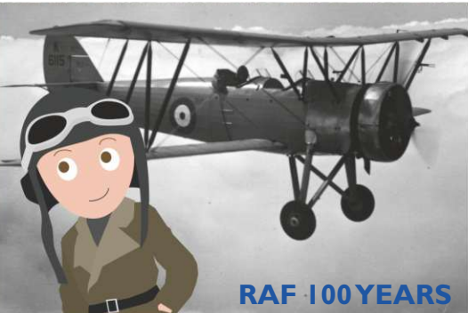
RAF 100 YEARS